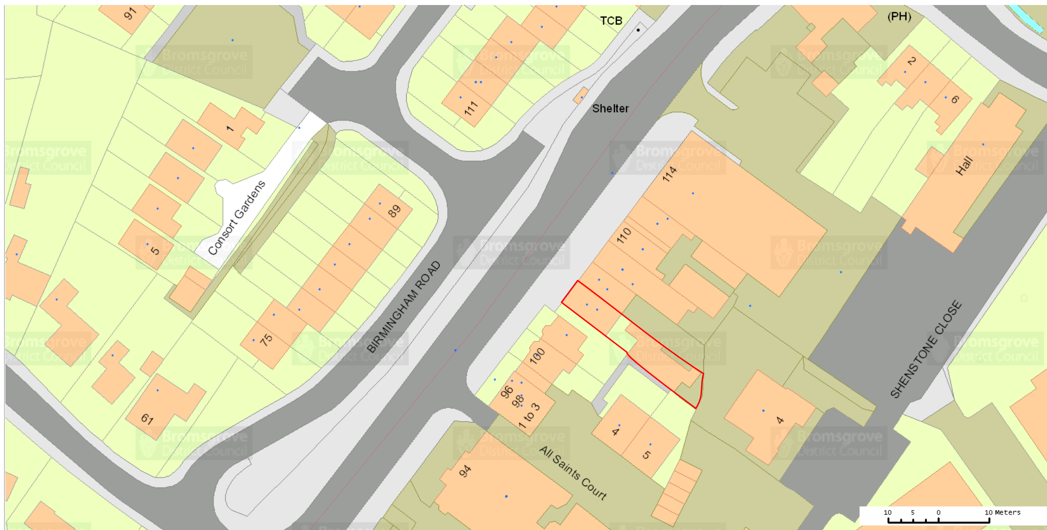
Figure 1 Site Boundary – Site Identified with Red Line