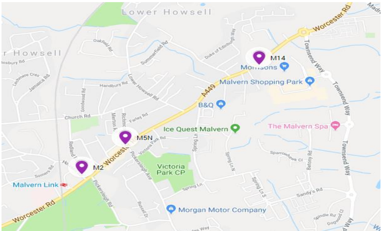
Monitoring locations in Malvern Link