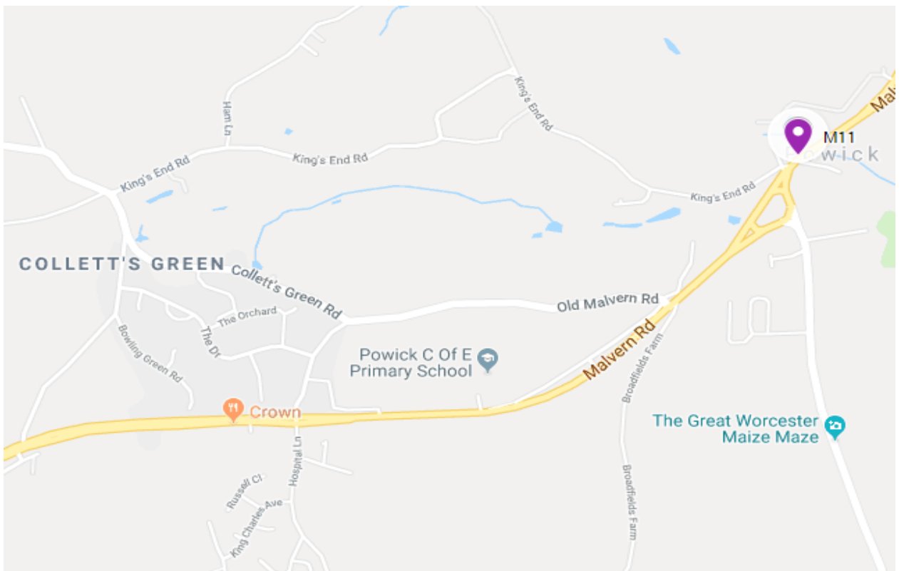
Monitoring Location at Powick