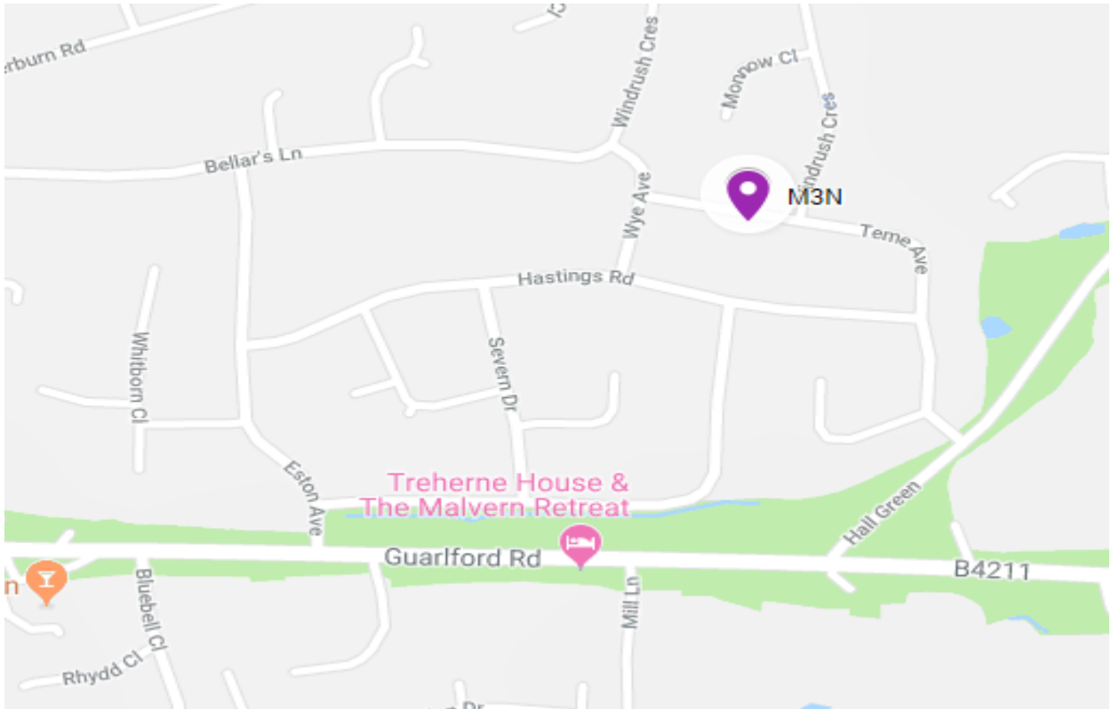
Monitoring Location Malvern Background