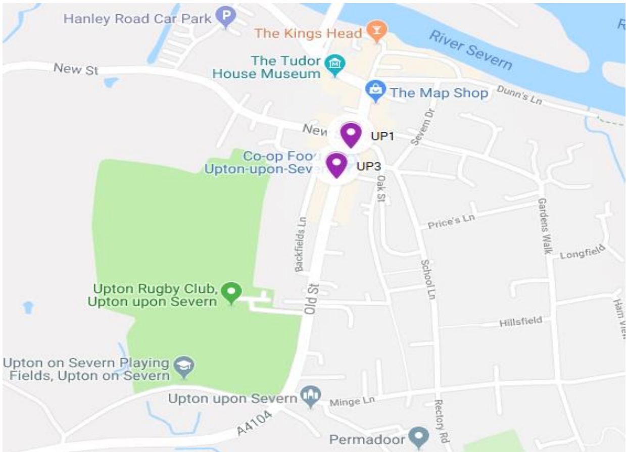
Monitoring Locations Upton upon Severn